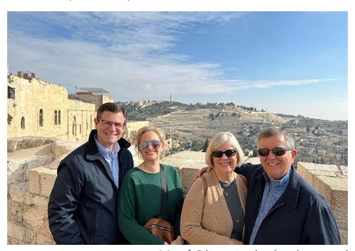
Mt of Olives in the background

After an Israeli breakfast you will visit the Mt of Olives and stand and enjoy a remarkable view of the Temple Mount and Eastern Gate from this vantage point. This is the place where, forty days after His resurrection, Jesus ascended into Heaven. (Acts 1:9).