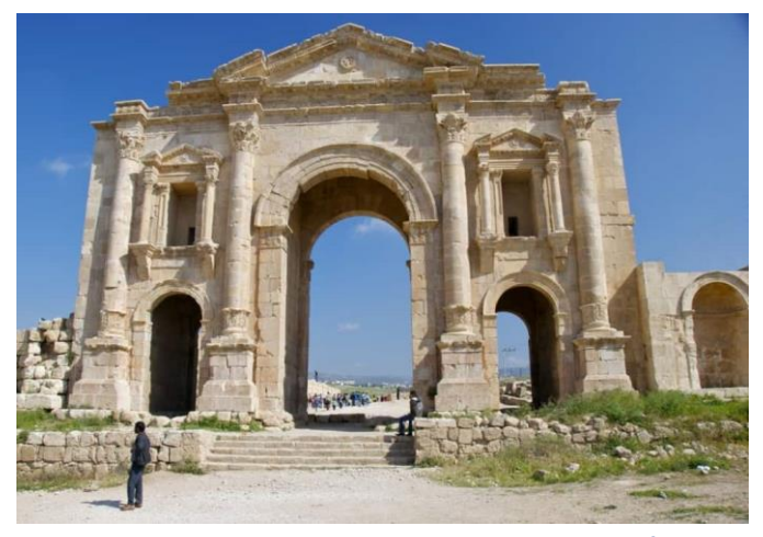
Hadrian's Arch at the south entrance of Jerash

Before crossing back over into Israel, you will visit the ruins of Jerash , one of the largest and bestpreserved Roman cities in the Middle East. It lies in a broad valley among the biblical mountains of Gilead , about 30 miles north of Amman.