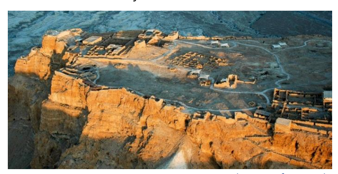
Ariel view of Masada

Ride in the cable car up to the top of Masada overlooking the Dead Sea. This was the location of one of King Herod the Great's palaces. It is a spectacular hilltop fortress. Here your guide will treat you to the history of the famous zealot stand. Ruins of the walls and massive Roman siege ramp are still visible today.