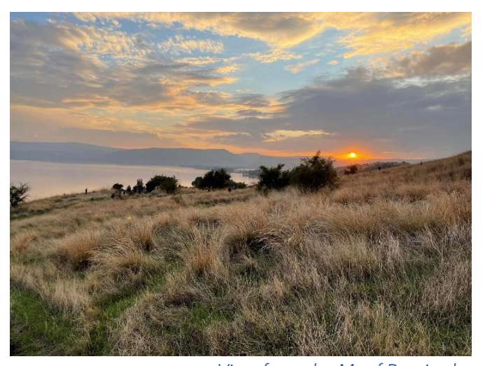
View from the Mt of Beatitudes

Ascend the peaceful Mount of Beatitudes which overlooks the Sea of Galilee and see the traditional site where Jesus preached His most famous sermon: the Sermon on the Mount. You will also view the traditional site of Job's Cave .