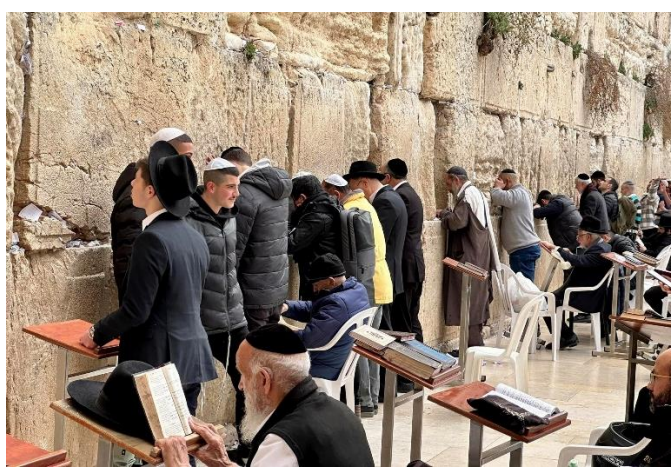
Orthodox Jews at the Western Wall

Throughout the day and night, hundreds of Jews gather to pray at the Western Wall and leave handwritten prayers in the spaces between the stones.