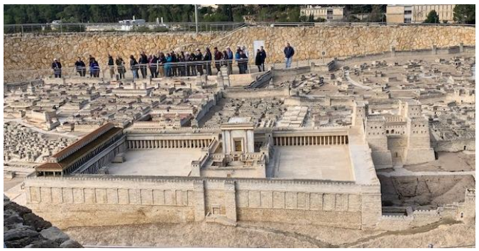
Second Temple model in Jesus' time

Enjoy time at the Israel Museum with the Shrine of the Book and view several priceless artifacts including the famous Dead Sea Scrolls. Adjacent to the museum is the open-air miniature model of Jerusalem that depicts the city of Jerusalem as it would have looked circa 70 A.D.