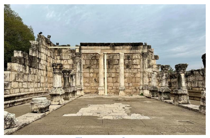
The ancient Capernaum synagogue

Explore Capernaum , the center of Jesus' ministry, before going to the synagogue which stands on the site where Jesus taught. Recall His teaching and preaching the gospel of the kingdom. (Matthew 4:13, 23).