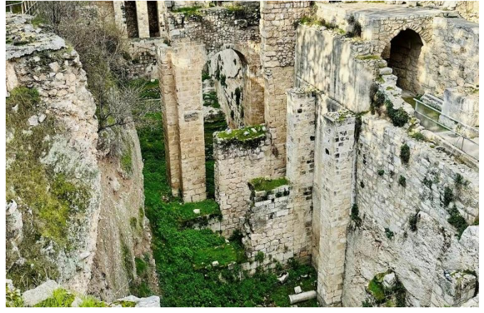
Ruins of the middle porch of the Pool of Bethesda

View the Pool of Bethesda , (John 5:1-31), where Jesus performed the Sabbath miracle healing the lame man at this pool. St. Anne's Church , with incredible acoustics, is perfectly preserved and dates back to the time of the Crusades.