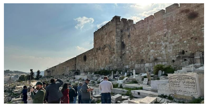
View of Eastern Gate from outside of Temple Mount

From the Temple Mount, view the Eastern Gate that faces the Mount of Olives. This is the gate where Jesus will make His triumphal entry into Jerusalem. (Ezekiel 43:1-2,4; 44:1-3).