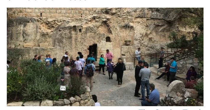
The Garden Tomb

The tour of Jerusalem continues with a visit to the Garden Tomb , from where you will view what some believe to be the place Jesus was crucified. The word Golgotha means "Place of a Skull". This hill stands just outside the walls at the intersection of two ancient roads.